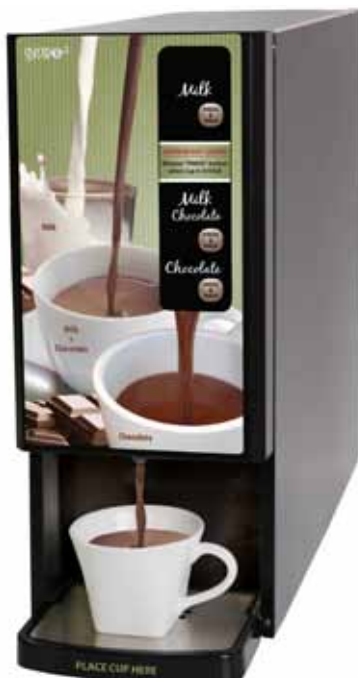
Also available in green

Equipped with two 2lb hoppers, the Bistro-2 was designed as a companion unit to NEWCO's Fresh Cup POD brewer. Deliver frothy hot milk and chocolate at the push of a button to create delicious cappuccino's, lattes and mocha chinos to both Coffee and tea PODS.